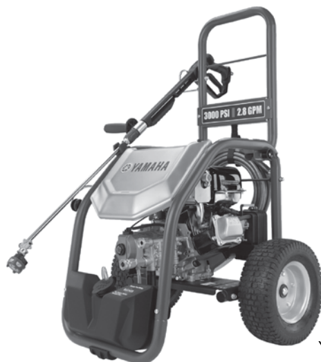
YAMAHA PW3028 MSRP $815